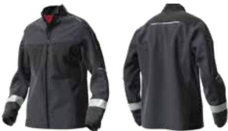
1822-565 BP® Robust work jacket Example with 1 reflective strip (5 cm) on each arm