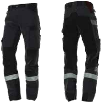
1818-565 BP® Robust hybrid work trousers with knee pad pockets Example with 1 reflective strip (5 cm) on each trouser leg