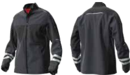
1822-565 BP® Robust work jacket Example with 2 reflective strips (2.5 cm) on each arm