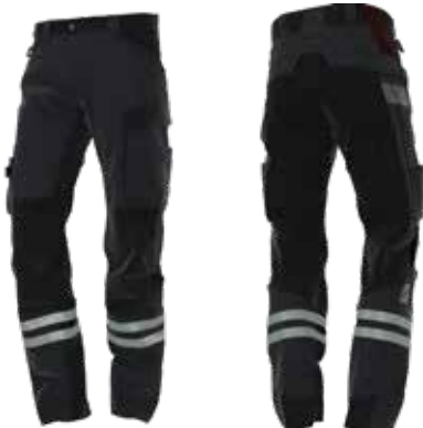
1818-565 BP® Robust hybrid work trousers with knee pad pockets Example with 2 reflective strips (2.5 cm) on each trouser leg